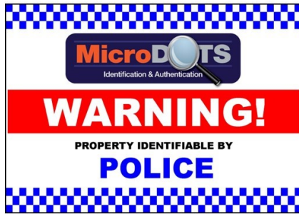
Warning Label A6